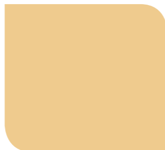
Feature: SULPHUR COLOUR