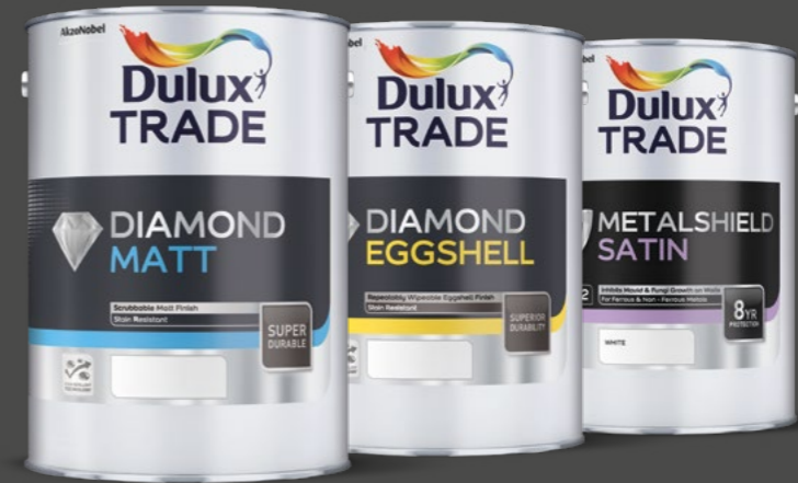
Diamond Matt and Eggshell

In the treatment rooms, for the paintable surfaces on the walls, woodwork and ceiling areas, the following finishes were chosen: