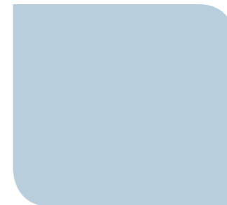
Feature: BLUE RIBBON