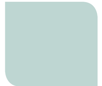
Feature: MONTPELIER GREEN

Colours printed by AkzoNobel have been reproduced as accurately as the printing process will allow. Where the colours are reproduced electronically, we have reproduced the colours as accurately as electronic media will allow. However, when colours are viewed on-screen, laminated, or printed by others, the colour representation may vary significantly and AkzoNobel can offer no guarantee as to its accuracy. Unfortunately, we cannot guarantee an exact colour match and the colours contained on this guide should not be relied on as such. Please ensure that you use a colour chip or test a small amount of mixed product in the actual surface to be painted before undertaking your decoration. This will give you a stronger indication of the appearance of the actual colour, which can be affected by the substrate and the texture of the surface, or by soft furnishings and the shape, size and lighting of the room. The Dulux Trade logo and all distinctive colour names are trademarks of the AkzoNobel Group of Companies (C) and Database Right AkzoNobel 2018.